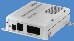
CRI-376 Centrex Recording Interface

Here's an economical way to operate analog equipment on MDC lines. The CTA-369 lets you directly connect modems, secure phones, card readers, auto dialers, answering machines, fax machines and more. You'll save money and headaches!