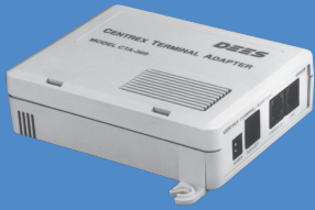
CTA-369 Centrex Terminal Adapter