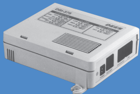
DSI-375 Meridian Custom Ringer

This easy-to-add interface lets you selectively record calls directly from MDC lines. It works with most industry standard recorders and allows users to easily select which line(s) are recorded.