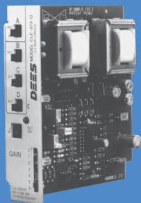
CLE-373 Centrex Loop Extender