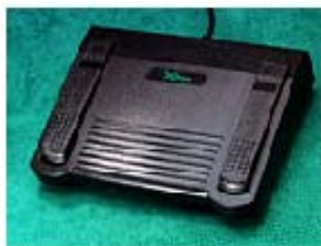
3 Key Foot Pedal