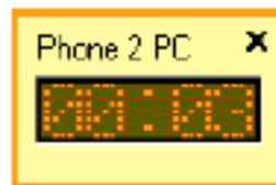
Screen Pop Counter for Convenient Position Reference